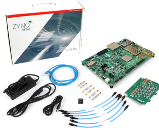
Part Number: EK-U1-ZCU111-G

The platform includes an evaluation board, cables, filters, documentation, verified reference design, and includes the XM500 RFMC balun transformer add-on card to support loopback evaluation and signal analysis.